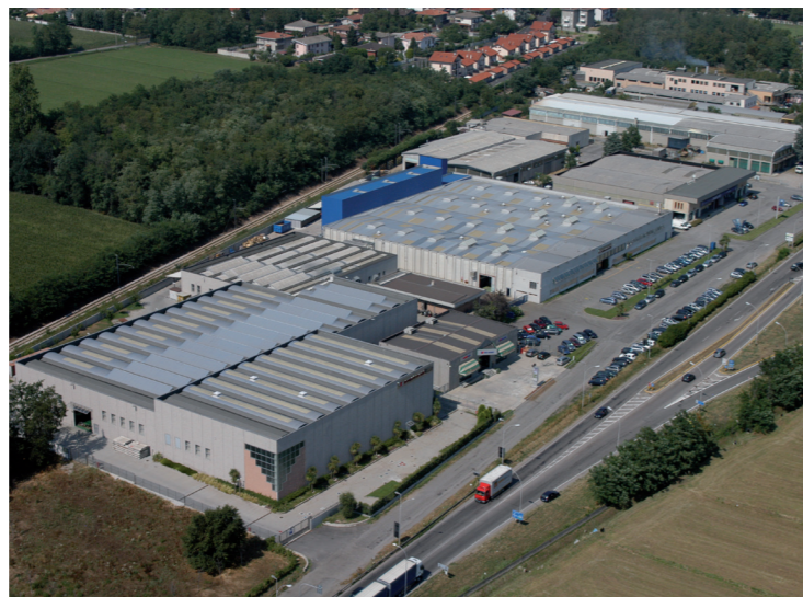
Pompetravaini Head Office and main production plant in Italy.

Liquid Ring Compressors for Oil & Gas and Petrochemical Industries (API)