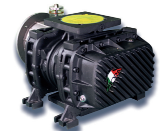
Vacuum Booster of Pompetravaini-BORA.