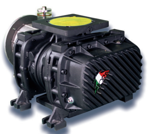
Vacuum Booster of Pompetravaini-BORA.