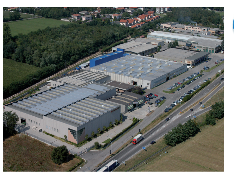
Pompetravaini Head Office and main production plant in Italy.